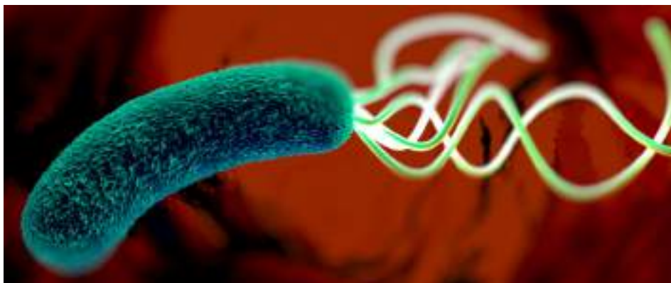
Helicobacter pylori bacterium

Note: In supporting individuals with H. pylori, consider the patient history, clinical symptoms, virulence genes, and the amount of H.pylori DNA detected in order to design a customized treatment plan.