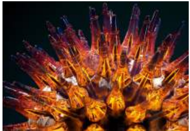
Cytomegalovirus is a viral genus of the viral family known as Herpesviridae