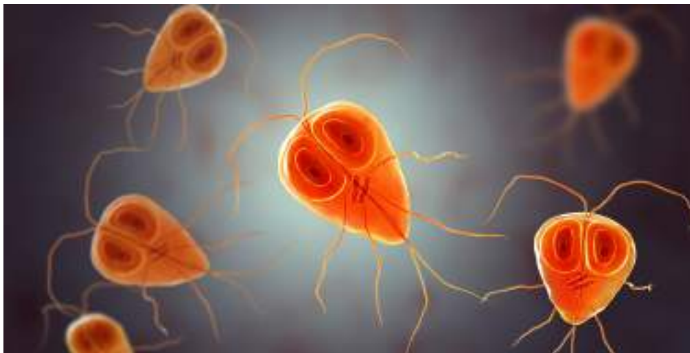
Giardia intestinalis protozoan

* Additional information (dosing, efficacy, etc.) on pharmaceutical treatment for parasites may be found at www.cdc.gov/parasites/index.html and in the Physician's Desk Reference.