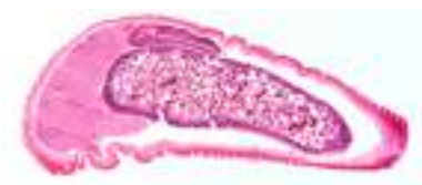
Microscopic cross section of a whipworm (Trichuris trichiura)