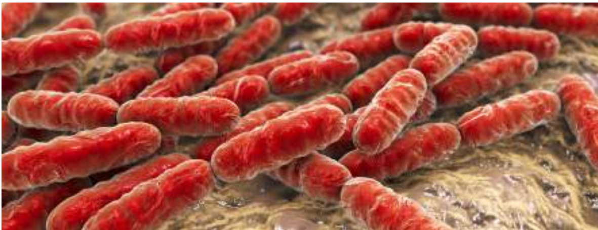
Bacteria Lactobacillus, lactic acid bacteria which are part of normal flora of human intestine

Trillions of microorganisms inhabit the human intestine to make up a complex ecosystem that plays an important role in human health. Commensal bacteria extract nutrients and energy from our diets, maintain gut barrier function, produce vitamins ( biotin and vitamin K ), and protect against colonization by potential pathogens.